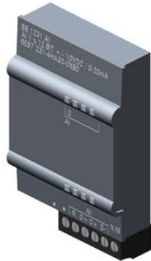
SIMATIC S7-1200, Analog input, SB 1231, 1 AI, +/-10 V DC (12 bit resol.) or 0-20 mA