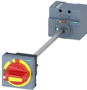
door mounted rotary operator EMERGENCY OFF IEC IP65 with door interlock accessory for: 3VA10/11