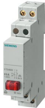
button, 1 NO/1 NC 20 A 1 key red, Lamp 230 V